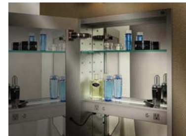
INTEGRAL LIGHT FEATURE